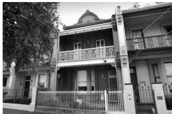
double storey terrace house