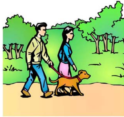
close to the park