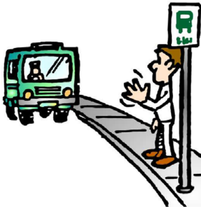
close to public transport