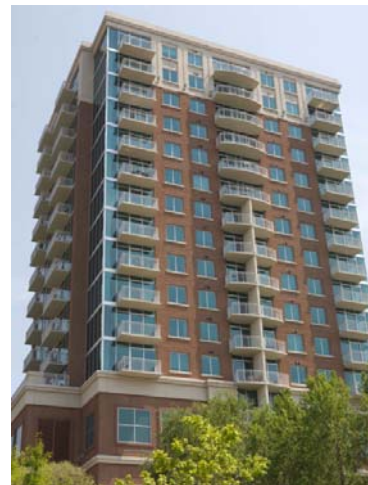
high-rise apartment block