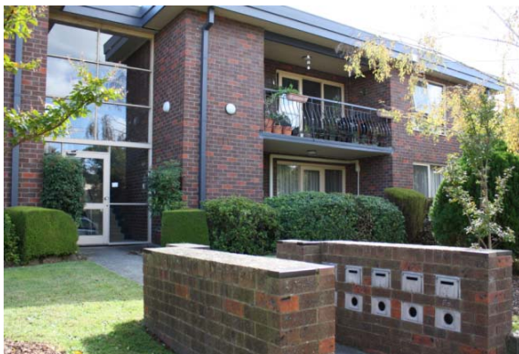
block of flats