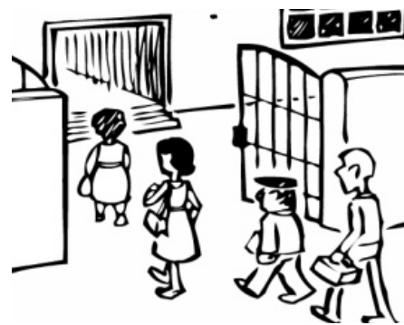
close to schools