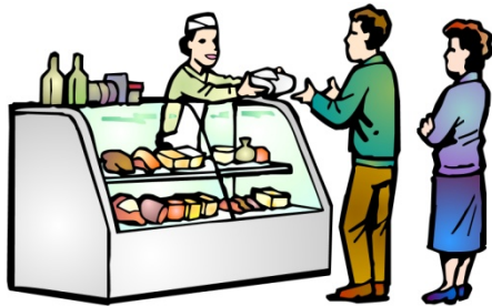
close to the shops

Do you like living at your house? Why? Why not?